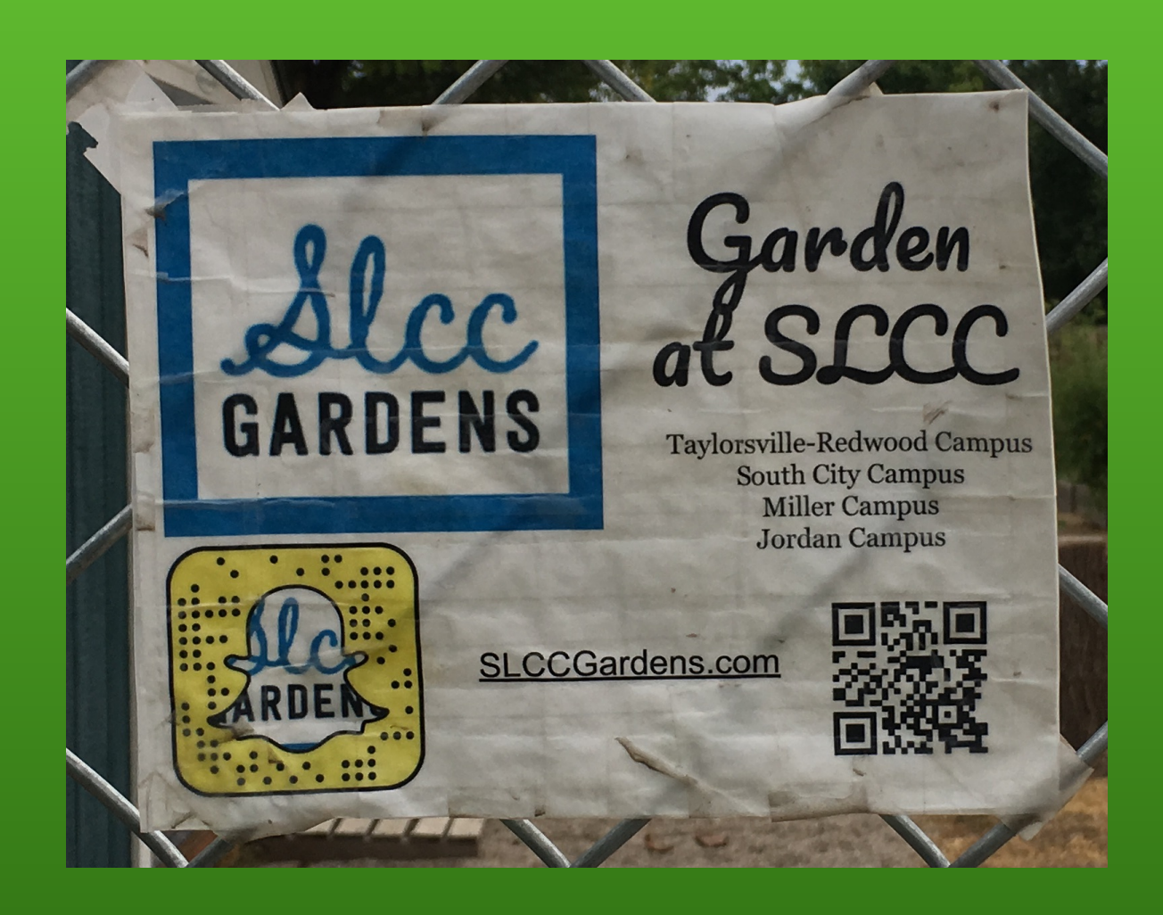
Exhibit B: Sign Project